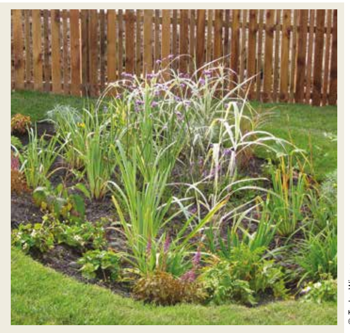
In-ground rain garden

Dig an area within easy reach of the down-pipe or the area/s that you want to drain, for example driveway or yard. Line the pit with a polythene liner. Re-connection to the existing drainage system will need more effort as it's below ground and again will need a suitably qualified person to ensure that plumbing and building control requirements are met. Direct connection to a nearby stream may also be acceptable with permission from SEPA. More comprehensive detail is required for larger systems serving larger areas or more than one property and a suitably qualified engineer or architect will need to be employed. However costs can be shared and improvements increased due to the larger area being considered.