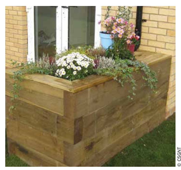
Professionally installed down-pipe rain garden

The layers above this will then need to be placed but make sure that the soil and finer gravels are not able to settle into the storm chamber which will cause the whole system to collapse. The use of fabric material is usually recommended to stop this from happening but this can also cause blockage over time. A natural fabric that will rot over time is best. By the time the fabric rots there will be enough support from the roots of plants to stop collapse from occurring. Place the gravel and soils accordingly.